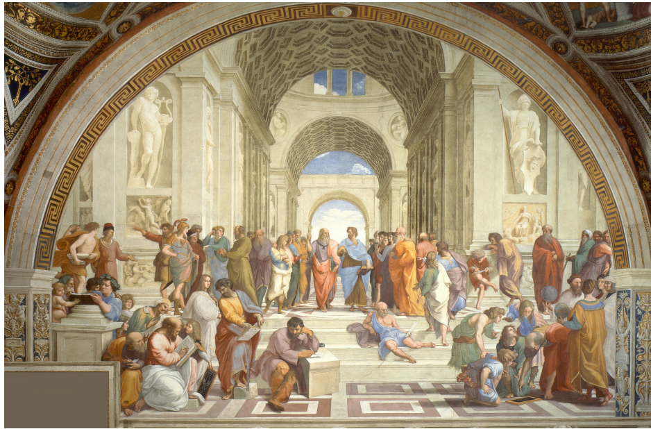
Click the picture for a detailed description